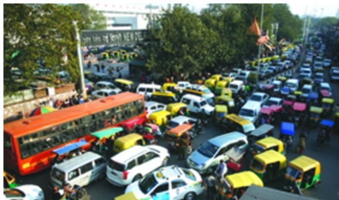
SIGNAL TO ANARCHY

Every person at Harmony Chowk, from the owner of a luxury car to a cyclist, seems hell bent on taking innovative shortcuts, violating every traffic rule in the book. This Harmony Chowk syndrome of saying two hoots to the duty of complying with traffic rules is the apotheosis of the Indian 'I'm-allright-Jack' paradigm: the entire nation, now in the grip of an unprecedented "my rights" revolution fanned by politicians, judiciary, NGOs and the media, cares not a whit about the concept of "my duties".